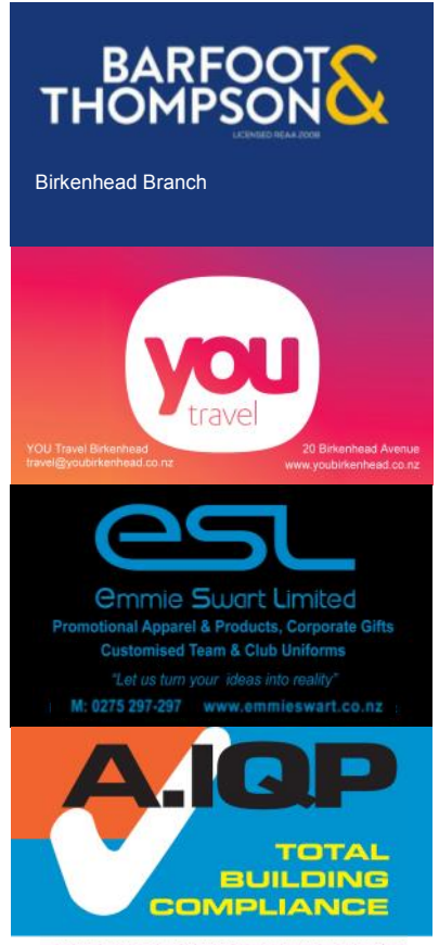
ASBESTOS MANAGEMENT PLANS